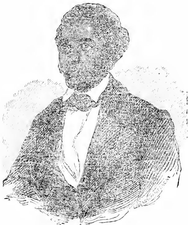
STEPHEN ALLEN BENSON, from Maryland, Second President of Liberia, elected for two terms of two years each.